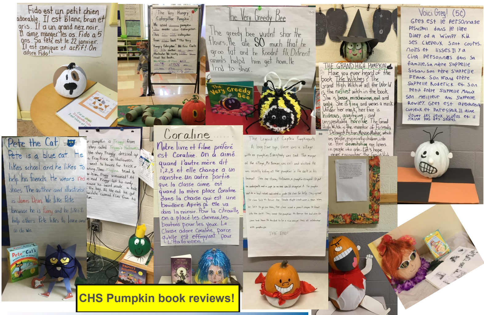
CHS Pumpkin book reviews!